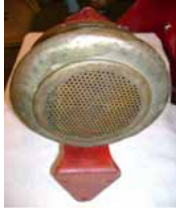
7. Hand Cranked Siren